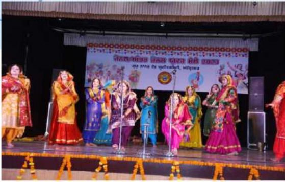
Giddha – 1 st Prize