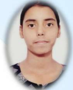
Shivani Installation 1 st Prize