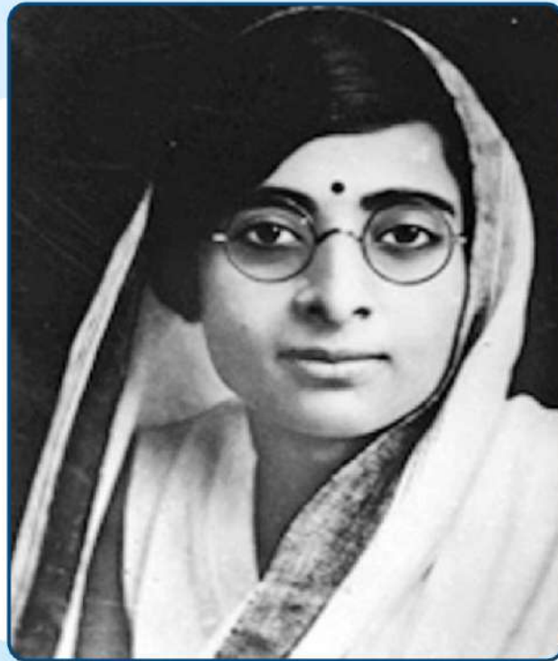
Smt. Kamla Nehru (1899–1936)