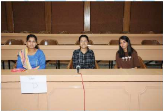
Quiz – 3 rd Prize