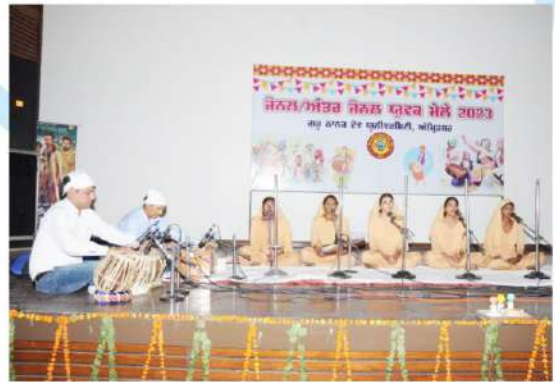
Group Shabad – 3 rd Prize