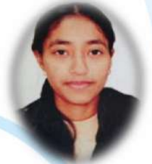
Kiran Installation 1 st Prize