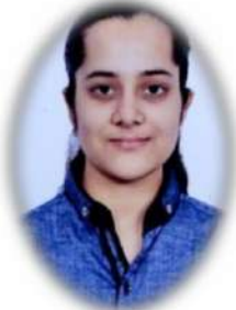
Manjot Photography 1 st Prize