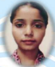
Babita Installation 1 st Prize