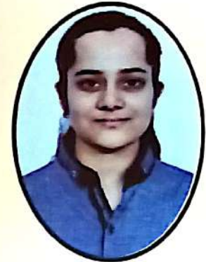
Manjot Kaur Photography 2 nd Prize