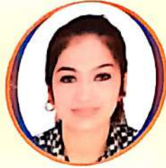
Charu 1887/2400 BA Sem-6