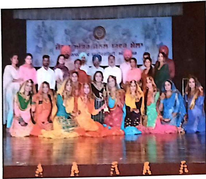
Giddha - 1 st Prize