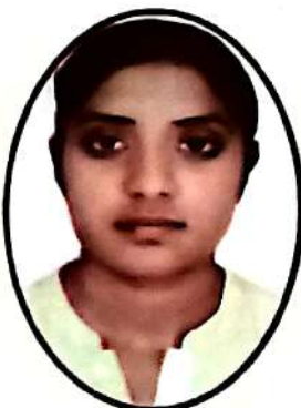
Khushbu Collage 2 nd Prize