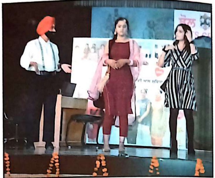
Skit - 1 st Prize