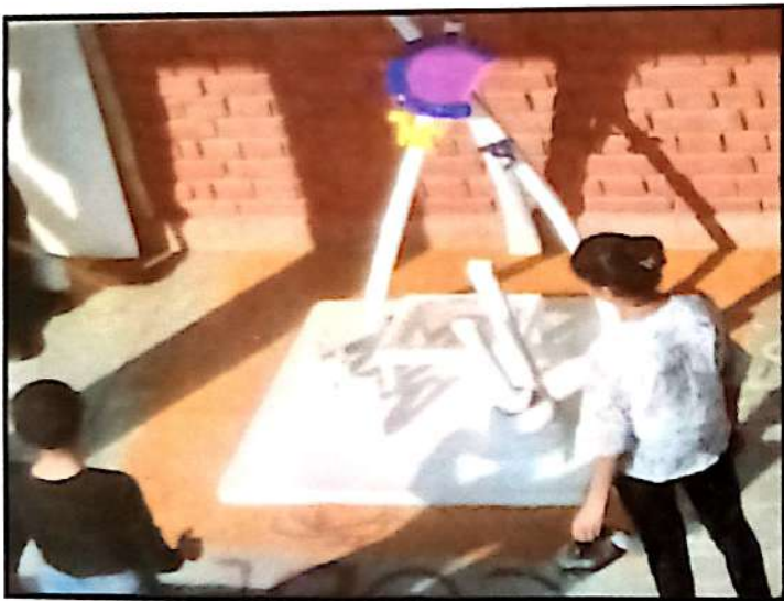
Installation - 2 nd Prize