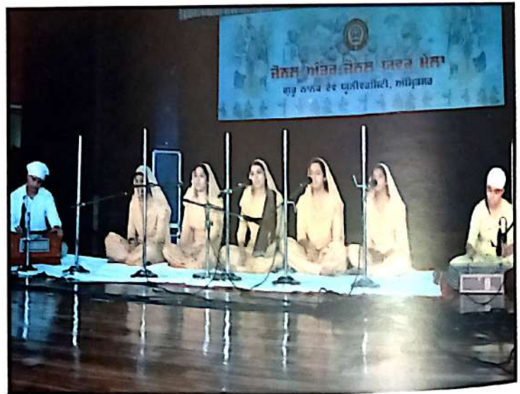
Group Shabad - 3 rd Prize